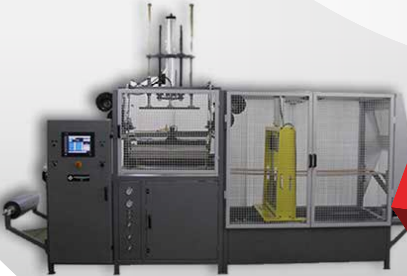
Automatic Vacuum Thermoforming Machine